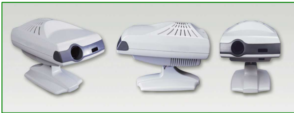
Chart Projector eCP-10